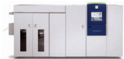
Continuous, ultra-high-speed, high-quality black and white output.